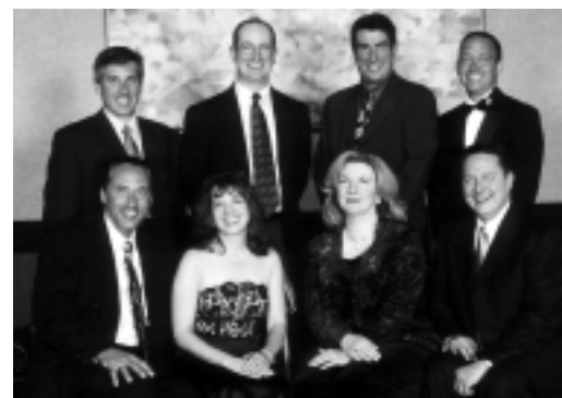
Class of 1988