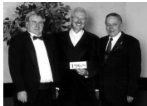
Class of 1968