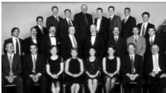
Class of 1983