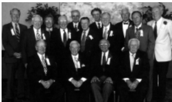
Class of 1953