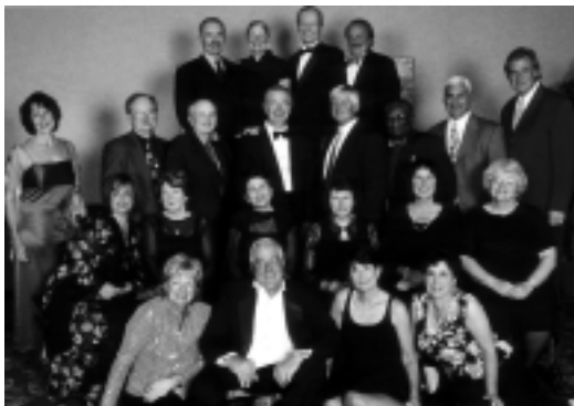
Class of 1973