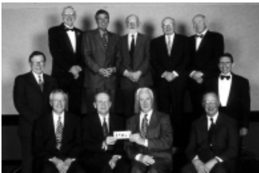
Class of 1963