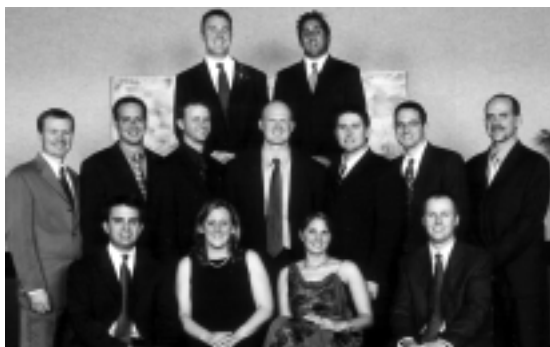
Class of 1998