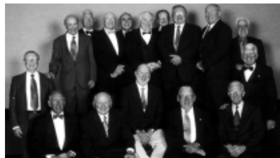
Class of 1958