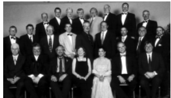
Class of 1978