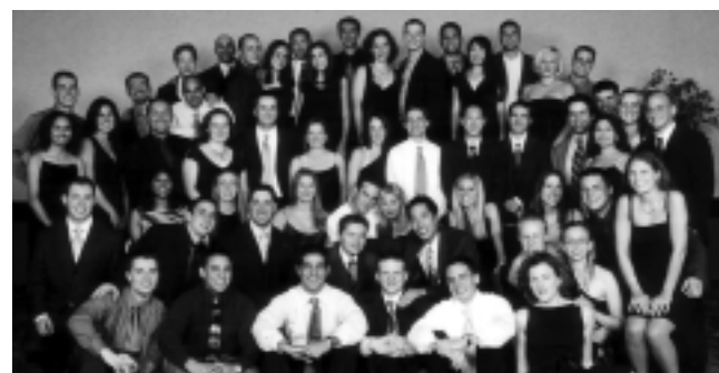
Class of 2004