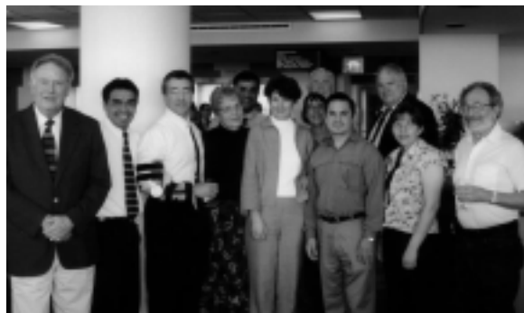
Oral Diagnostic Sciences Department