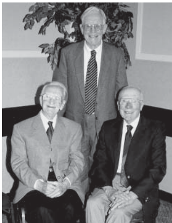
Class of 1942