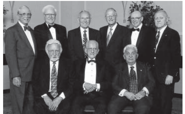
Class of 1947