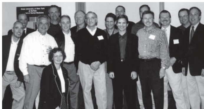
Class of 1977

The School of Dental Medicine welcomed over 50 alumni and guests at a reception at Squire Hall to celebrate five-year reunions. Graduates and their families chatted with school faculty, administrators, and students. Many attendees participated in a 'behind the scenes' tour of the school.