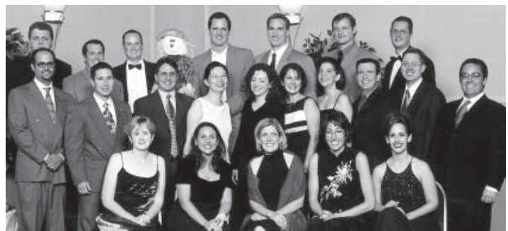
Class of 1997