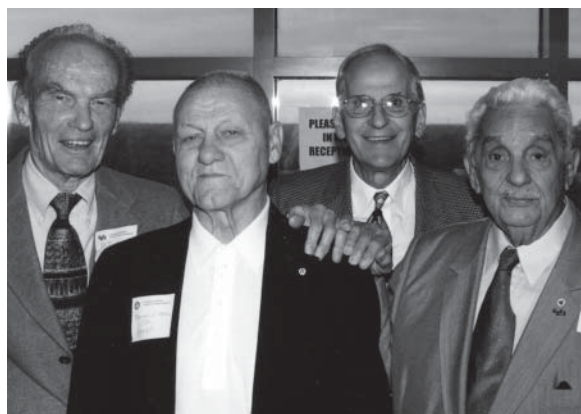
Class of 1947