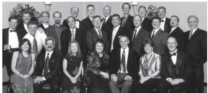
Class of 1982