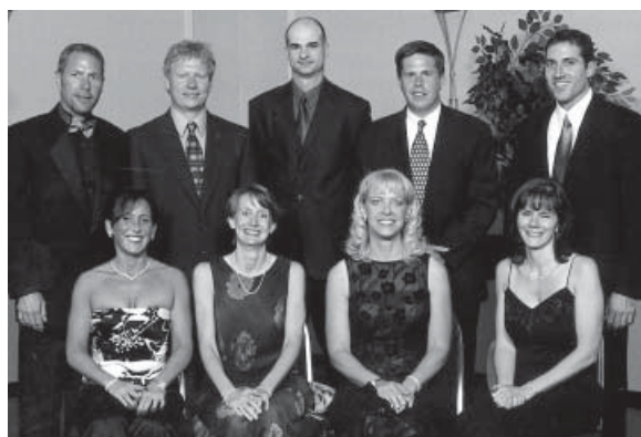
Class of 1992