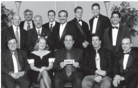
Class of 1987