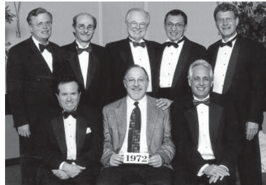
Class of 1972