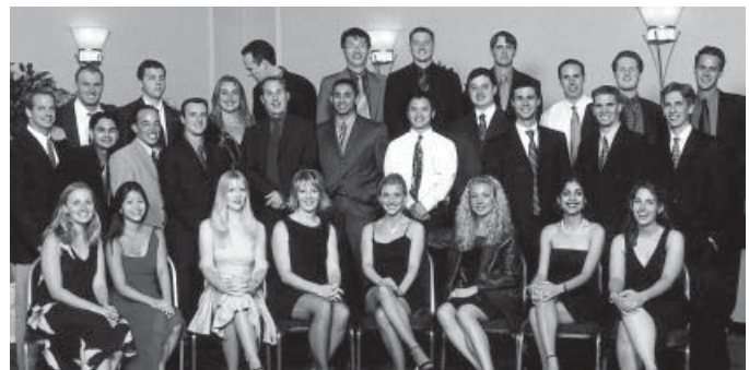
Class of 2003