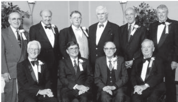
Class of 1952