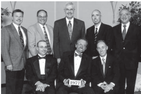
Class of 1977