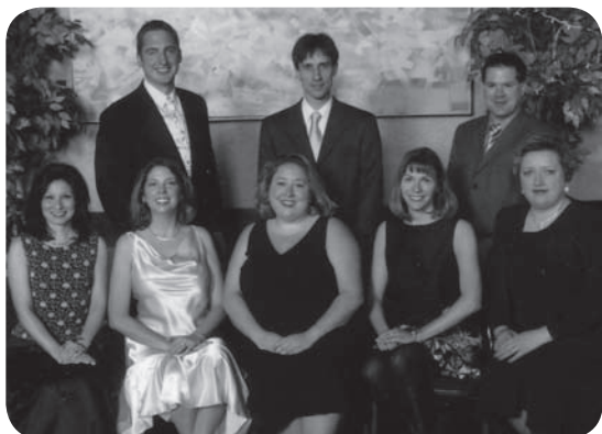
Class of 1999