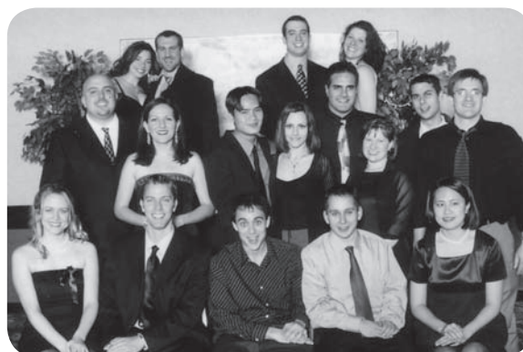
Class of 2005