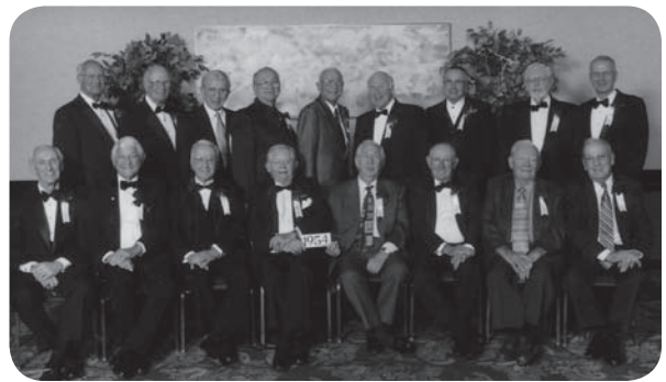
Class of 1954