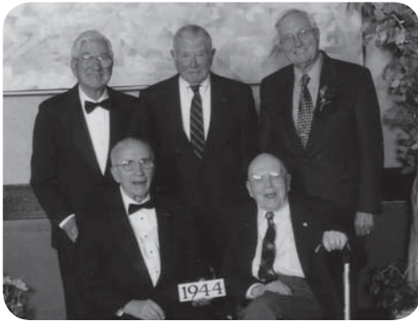
Class of 1944