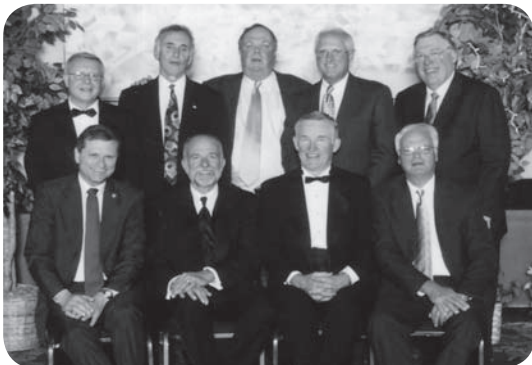
Class of 1964