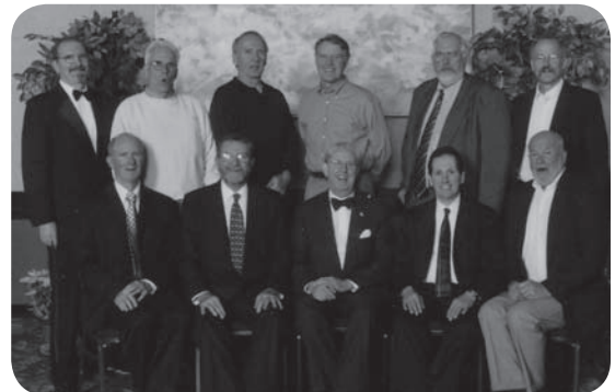
Class of 1969