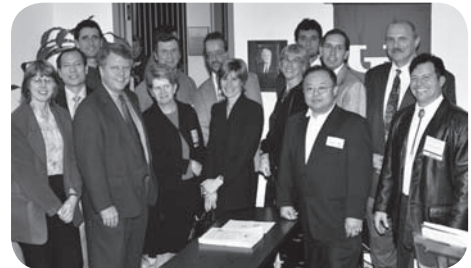
Class of 1984