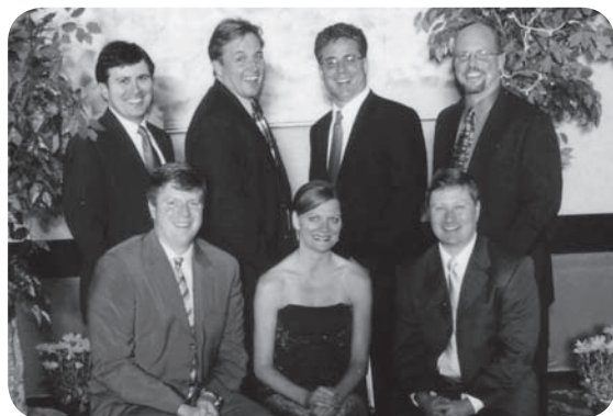
Class of 1989