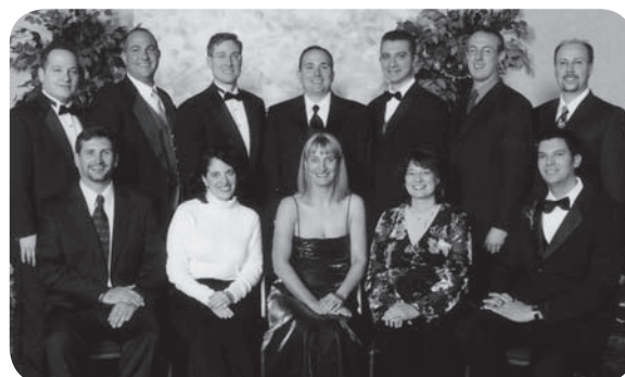
Class of 1994