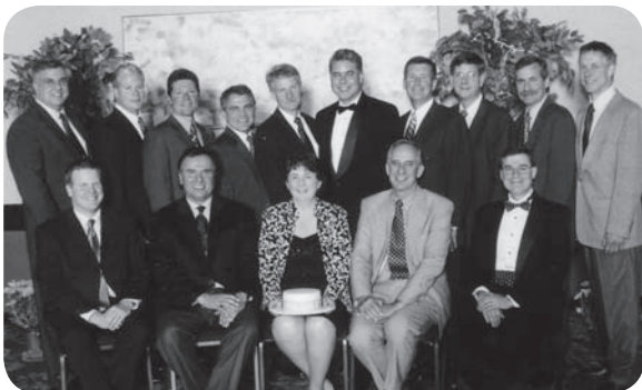
Class of 1979