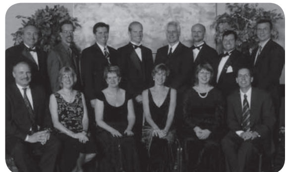
Class of 1984