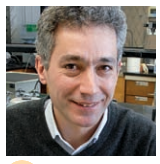
RESEARCH NEWS In sickness and in health: sorting out saliva's role as a host