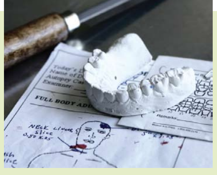
A UB STUDY CHALLENGES THE COMMON BELIEF THAT EVERY BITEMARK CAN BE LINKED TO A SPECIFIC PERPETRATOR. \bigtriangleup

The UB study, published in the Journal of Forensic Sciences, used dental models on cadaver skin.The results indicated that when dental alignments were similar, it was difficult to distinguish which set of teeth made the bites. Distortion noted in the bitemarks allowed matches even from different alignment groups.